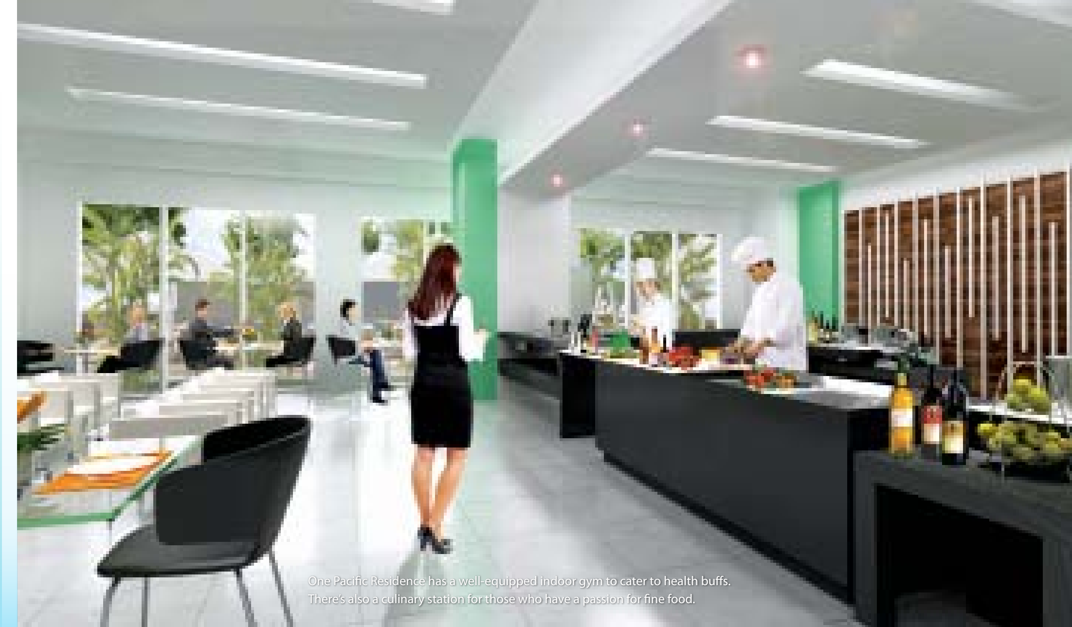
One Pacific Residence has a well-equipped indoor gym to cater to health buffs. There's also a culinary station for those who have a passion for fine food.