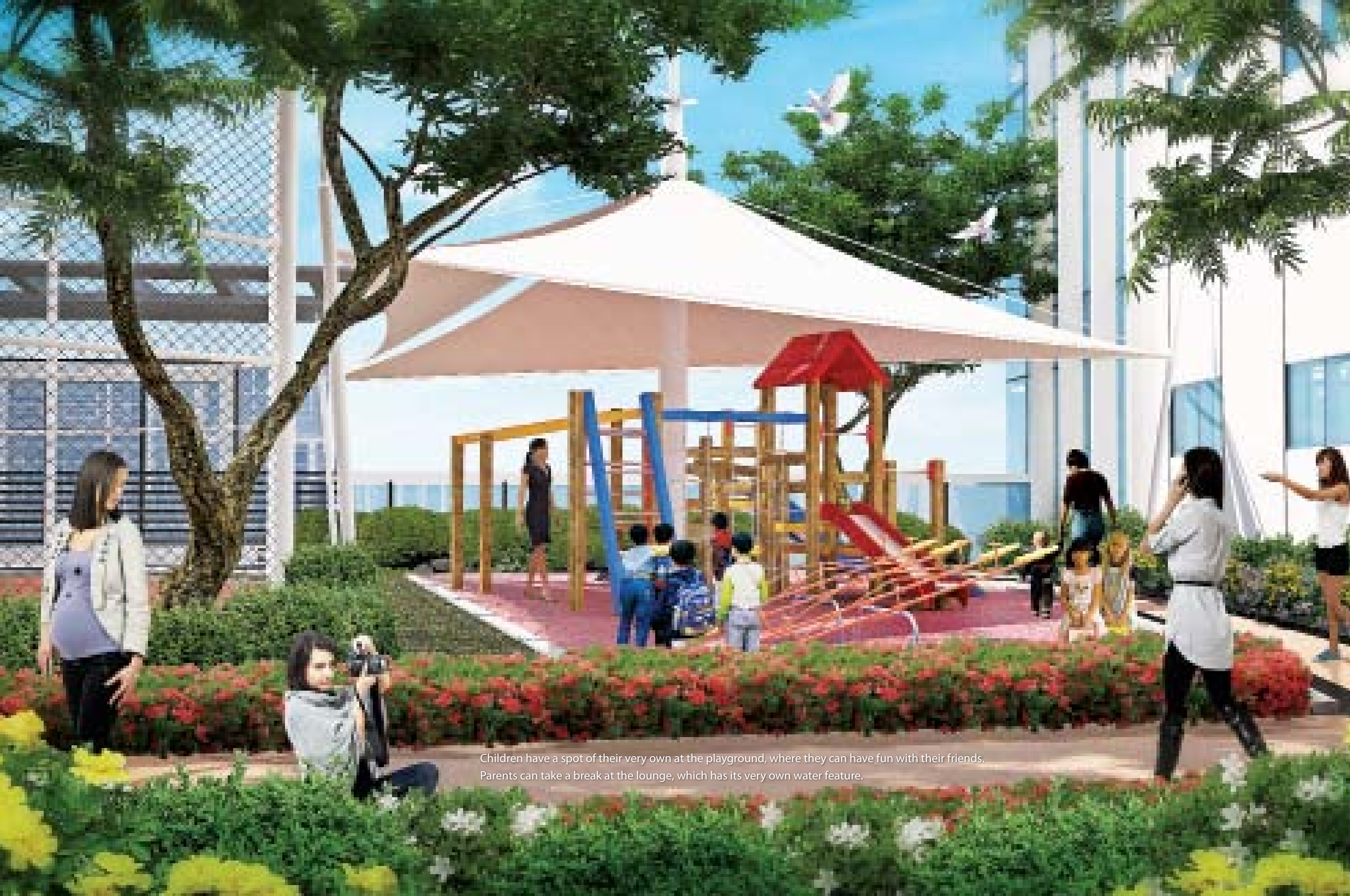
Children have a spot of their very own at the playground, where they can have fun with their friends. Parents can take a break at the lounge, which has its very own water feature.